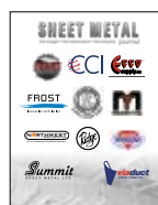
Back Cover Logo