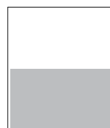
1/2 Horizontal 7 x 4.625"