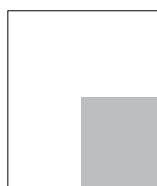
1/4 Page 3.375 x 4.625"