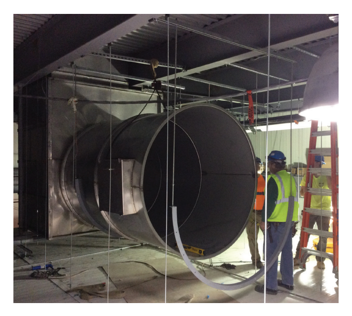
Sheet metal workers installing some 76" stainless steel supply duct, at the Kraft-Heinz Plant Expansion in Lowville, NY, one of Hyde-Stone's currently ongoing projects.

Not only is the software easy to learn and easy to use, but FastEST is renowned for its reliable and friendly customer support—online training is included with purchase or lease of the estimating software.